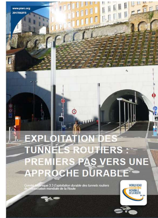
Rapport PIARC 2017